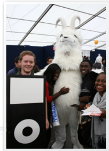
They are all signing up to win a moral dilemma

There are many students around the country who would like to talk more about issues of faith. Staff and Student leaders have begun setting up Connect groups, where students can have their questions addressed and get a fuller understanding of the gospel in a small group setting. The hope is that many more of these students would become committed followers of Jesus with a vision to reach their university.